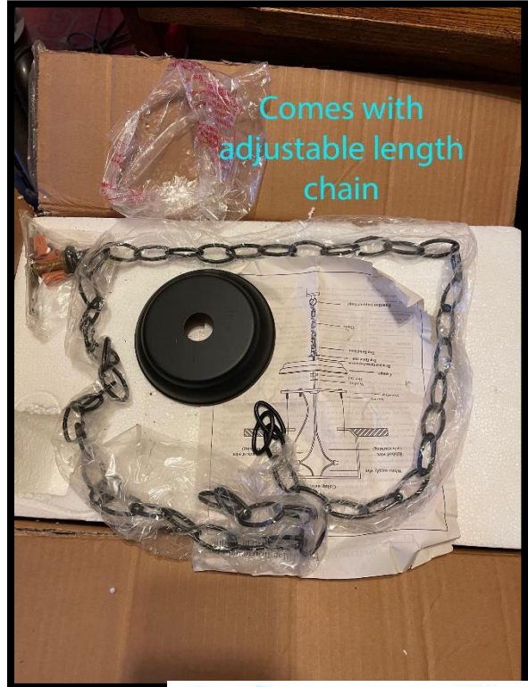
Proposed Ceiling Light