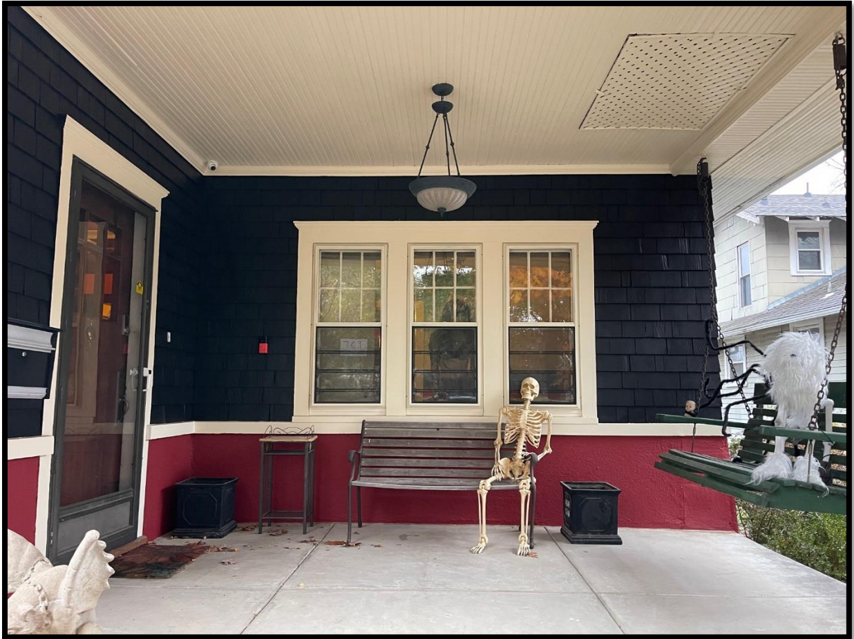
2023 Applicant Photo – Porch