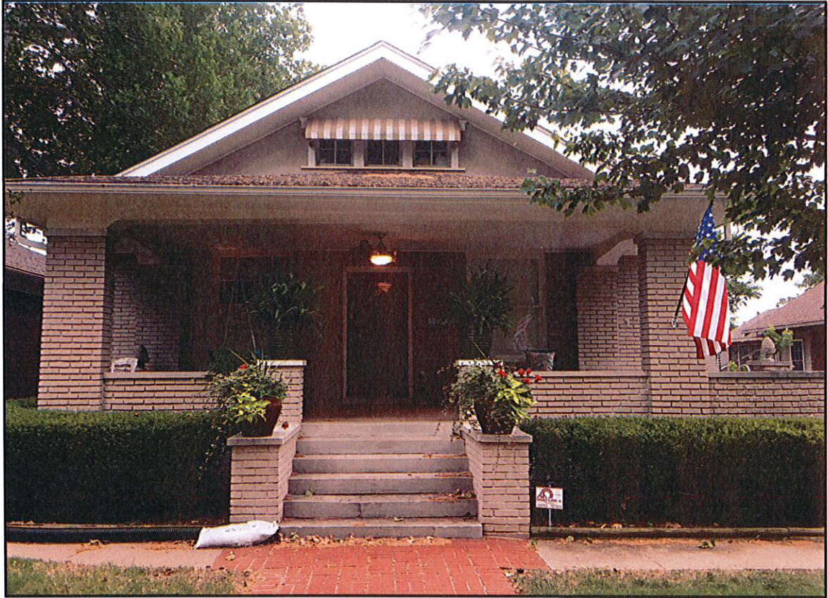
220 East 19 th Street - North Facade